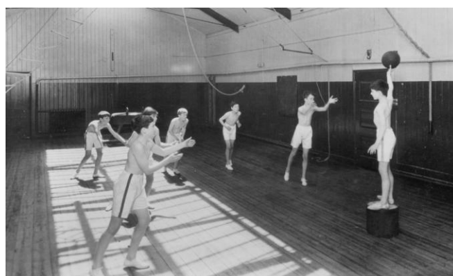
Tyttenhanger Lodge Gymnasium in the 1950s

Although these once flourishing educational institutions are now largely a memory, the Museum maintains a rich archive of this period and our display reflects some of this heritage whilst bringing us up to date with more recent school sporting activities.